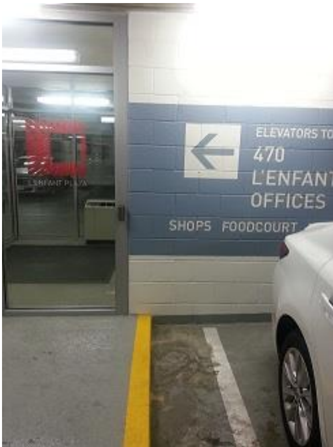
Elevator entrance for garage level (G1)

After parking, follow the signs on the pillars in the garage that read "Elevator Stairs" that leads to these painted signs: