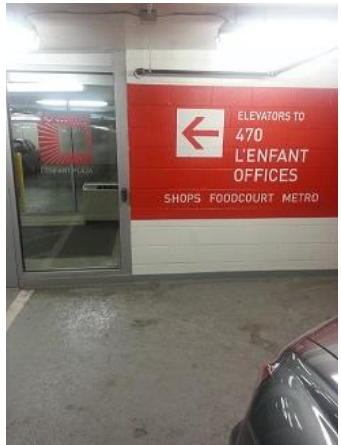
Elevator entrance for garage level (G2)